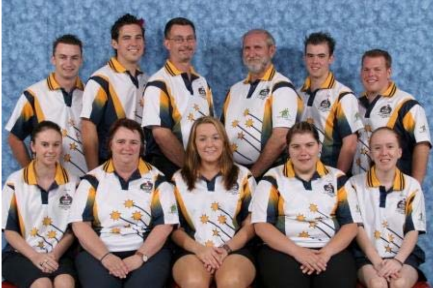
NEW SOUTH WALES CENTRAL